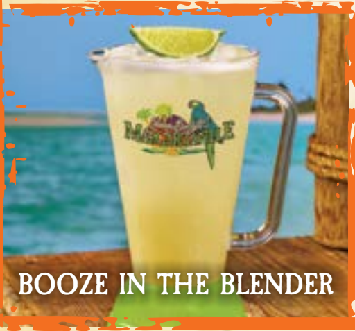
BOOZE IN THE BLENDER

Margaritaville Silver Tequila, Blue Curaçao and our house margarita blend. Served on the rocks (280 calories)