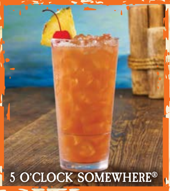
5 O'CLOCK SOMEWHERE®

Myers's® Original Dark Rum blended with blackberry and banana purées and topped with Cruzan® Hurricane Proof Rum. Served frozen (310 calories)